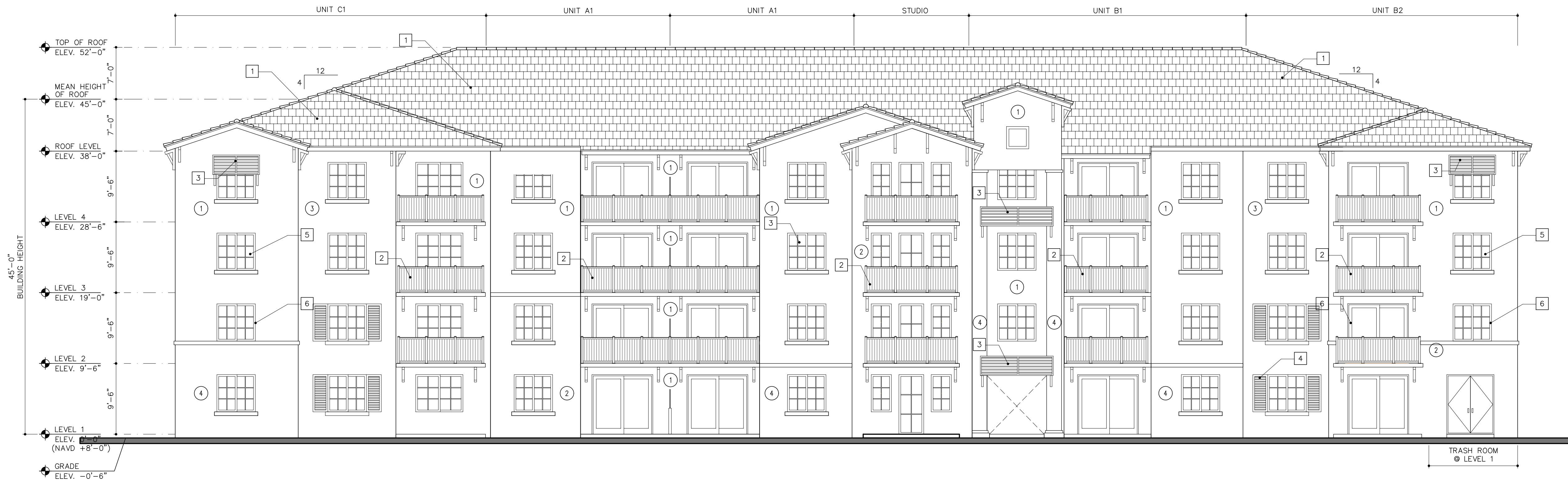
1 FRONT ELEVATION (SOUTH ELEVATION)